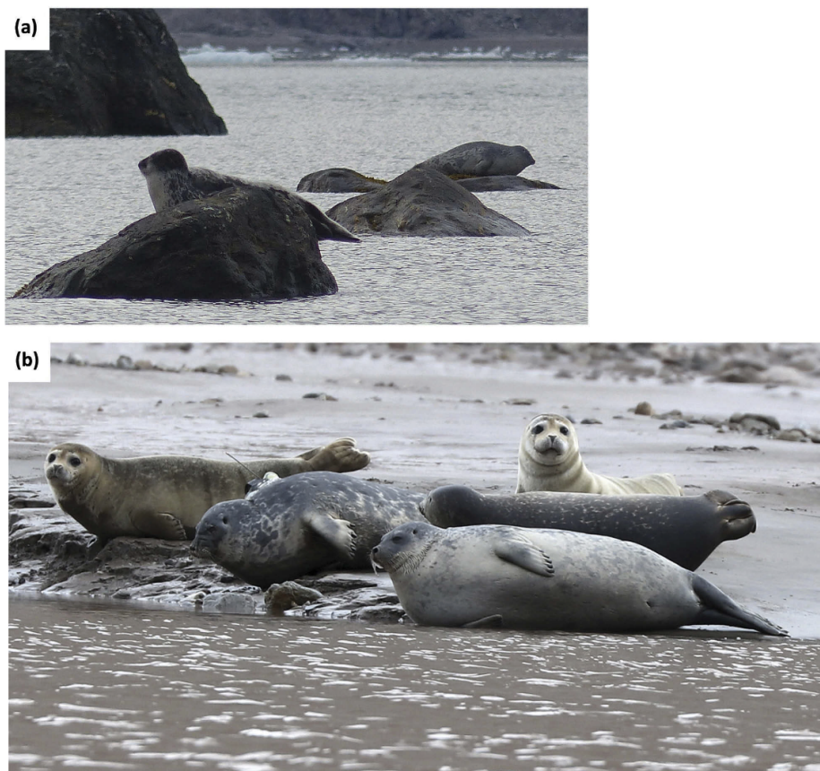
Figure 2. (a) Ringed seals hauled-out on rocks in Adolfbukta, Svalbard; note glacier ice in the background. (b) Three ringed seals (in the foreground – one with a Satellite Relay Data Logger) and two harbour seals in the background hauled out together on shore in St Jonsfjorden, Svalbard; the yellowish fur of the two harbour seals shows that they are still moulting.

Harbour seals in Svalbard constitute the worlds' northernmost population of this species (Prestrud & Gjertz 1990; Andersen et al. 2011). A recent study of space use by these seals showed that they had a strong preference for the west side of the Svalbard Archipelago, staying mainly in coastal areas over the continental shelf, and seldom entering the Hord systems (Blanchet et al. 2014). Blanchet et al. (2014) showed that their distribution was largely restricted to coastal areas that were heavily influenced by Atlantic Water. Since both the temperature and influx of this water type is predicted to increase in the future in Svalbard, environmental conditions in the archipelago are expected to become more favourable for harbour seals (Blanchet et al. 2014; Blanchet et al. 2015; Hamilton et al. 2014). Expansion of this "temperate" species is likely to be negative for the Arctic ringed seals, which are already