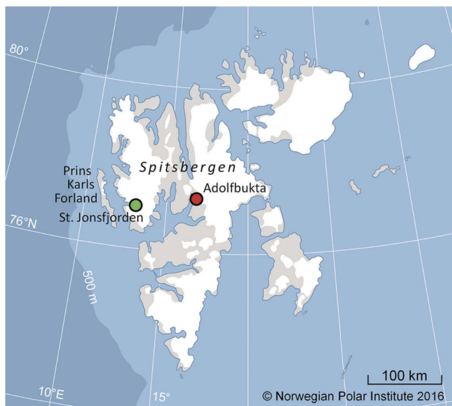
Figure 1. Map of Svalbard where place names mentioned in the text are indicated. The red dot is where the ringed seals in Fig. 2 (a) were hauled out and the green dot is where the mixed group of ringed and harbour seals in Fig. 2b were hauled out.

During the last decade, influxes of Atlantic Water (Cottier et al. 2005) with increasingly higher temperatures (Spielhagen et al. 2011) have replaced Arctic Water masses in the Hords on the west coast of Svalbard. Consequently, sea ice has formed late in the season or in some years has not formed at all (Lydersen et al. 2014). When sea ice forms late in the season there is generally not time for enough snow to accumulate, preventing ringed seals from being able to construct birth lairs. In recent years, the few areas that did have sea-ice in April have had unnaturally high densities of ringed seals. Most pups that have been born on the open ice have been killed by predators. In addition, very little sea ice has been available for the post-breeding moulting period over the past decade as well, forcing some ringed seals to undergo this process in the water with increased energetic costs due to increased heat loss.